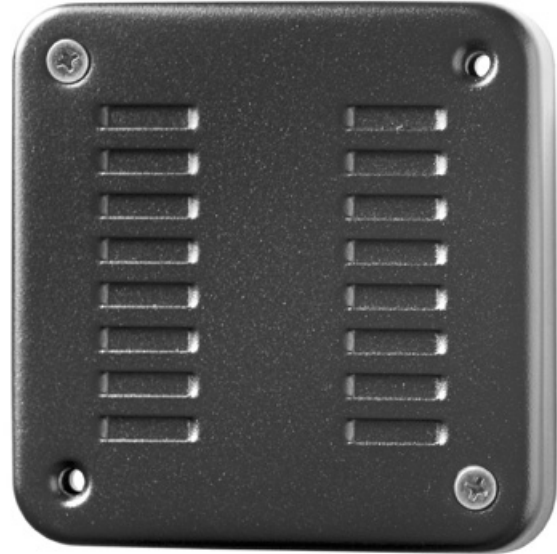
Two Note Electronic Chime