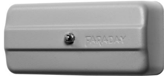
Model 1531 or 9650 Single Note Chime