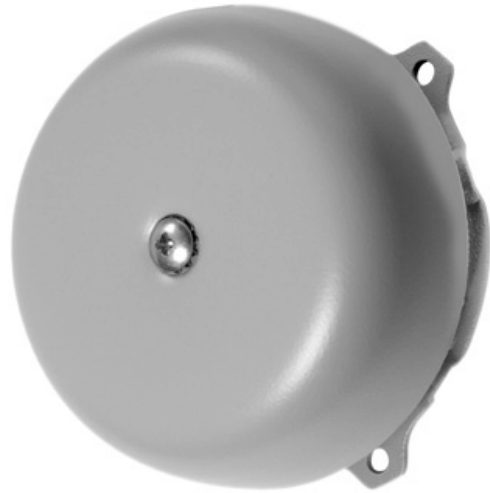
3" Monitoring Bell

Frames and covers of heavy pressed steel gongs of specially cold-pressed gong steel.