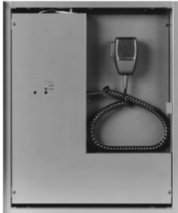
VPS-25 With Keylocked Door Removed

The VPS-25 is housed in an attractive surface or semi-flush mounted backbox, with a hinged and key locked door.