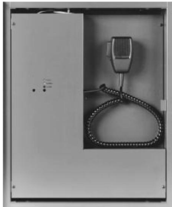
VPS-50 With Keylocked Door Removed

The VPS-50 is housed in an attractive surface or semi-flush mounted backbox, with a hinged and key locked door.