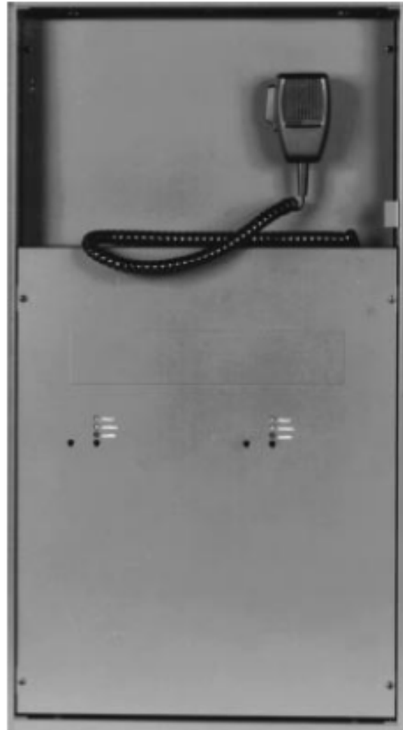
VPS-200 With Keylocked Door Removed

The voice evacuation system shall provide 200 Watts of signal and voice power, and shall be UL listed. All speaker circuits shall be field selectable